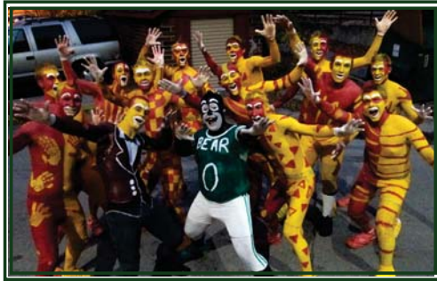
Painted Eta YLH'ers

Homecoming 2012 was successful for Eta Chapter! This year's pairing of Gamma Phi Beta, Alpha Gamma Rho, Alpha Tau Omega, and Lambda Chi Alpha received 2nd Place Overall, as well as placings in other notable events. We received 2nd Place in Lawn Display, 2nd Place in Yell Like Hell with Best Script and Best Theme Awards, and 1st Place in Blood Drive.