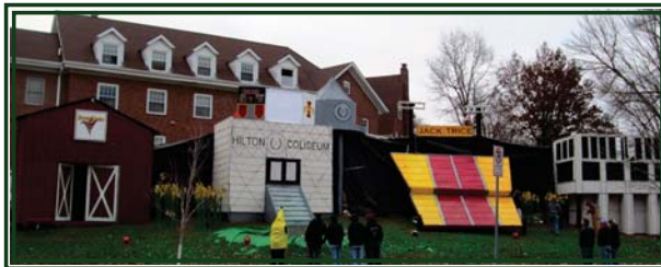
Completed Lawn Display